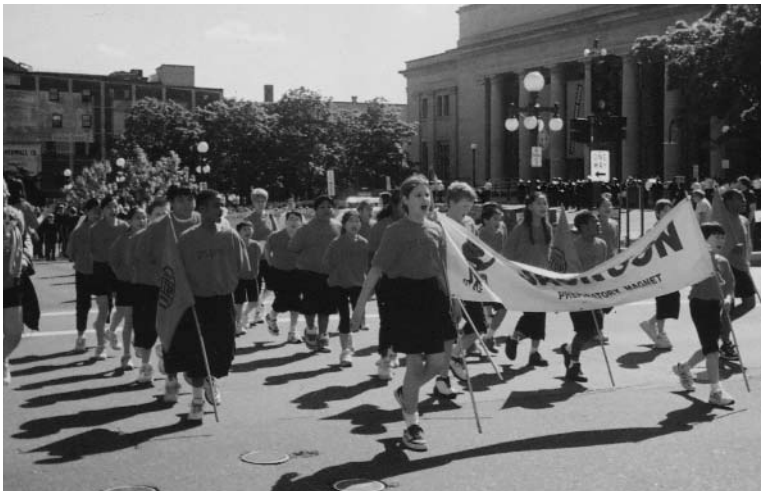
2004 student parade participants

As one of the longest running Jaycees projects in the country, the St. Paul School Police Patrol Parade and Picnic should not be missed. On May 9, the city will recognize the fifth and sixth grade crossing guards involved with the St. Paul School Patrol.